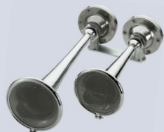
Diaphragm acoustic horn unit for 2097 GM

ALL DIAPHRAGM ACOUSTIC HORNS ARE AVAILABLE FROM US AS SPARE PARTS IN VARIOUS PITCHES.