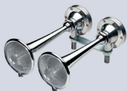
Diaphragm acoustic horn, small d'' d'' for 2298 GM

THE DIAPHRAGM ACOUSTIC HORNS ARE ALSO AVAILABLE IN PAIRS: