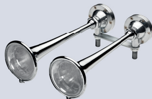
Diaphragm acoustic horn, large a' a' for 2298 GM