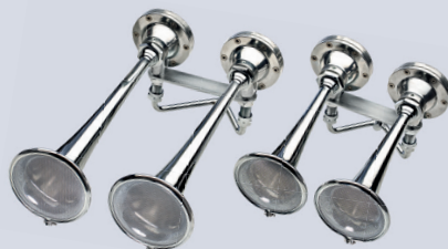
Diaphragm acoustic horn unit for 2298 GM