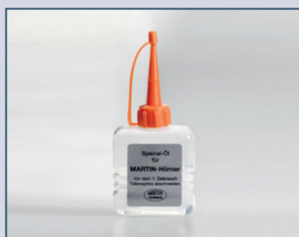
Article No. 2680.01 Special oil for MARTIN horns, Small spray can containing 50 ccm

When ordering, please indicate the operating voltage!