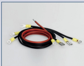
Article No. 2651.21 Set of cables 24 Volt