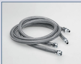
Article No. 2561.13 Connection hose Ø 13 mm, 1 m long with 1 union nut, 1 retaining screw and 2 hose grommets and 2 hose clamps