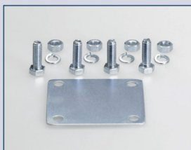
Article No. 70-5211.04 Reinforcement plate