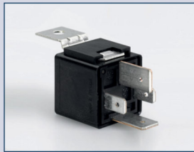
Article No. 2652.10 Relay for 12 Volt